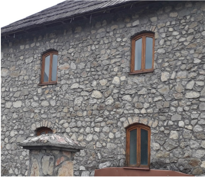
The north side of the mosque with a prominent stone wall and windows

The external appearance of the mosque, in addition to the windows and grandiose stone walls, is completed by a beautiful minaret, leaning against the western wall of the mosque. The minaret is placed on a round pedestal (cup) made of stone, which reaches to the top of the mosque wall. The minaret is climbed from the nahvil. Sherefa has the form of a wide belt at the end of the minaret. Sherefa is covered with a conical roof made of wood. On the top of the minaret there is a lamp with one ball. The minaret itself, with its architectural and constructional characteristics, fits into the overall ambience of the mosque.