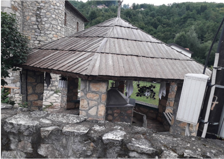
Shardvan in front of Petnjica mosque