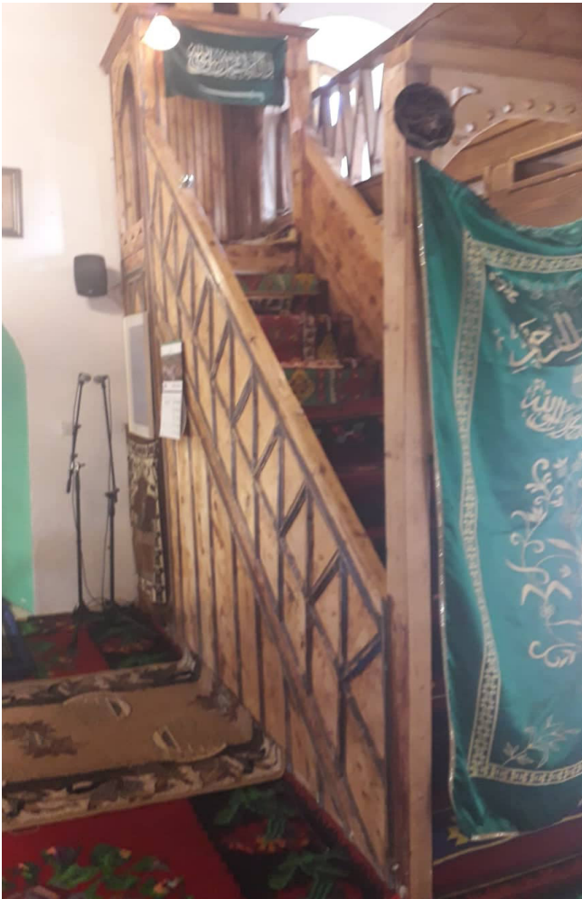
Mimber of the mosque

The mimber occupies the space between the mihrab and the right wall of the mosque, so that its front part leans against the front wall of the mosque. It is built from solid wood with some machine and hand decoration. The minbar is ascended by wooden steps facing the qibla. The stair railing is made of posts and protective boards on one and the other side. The space under the stairs is closed