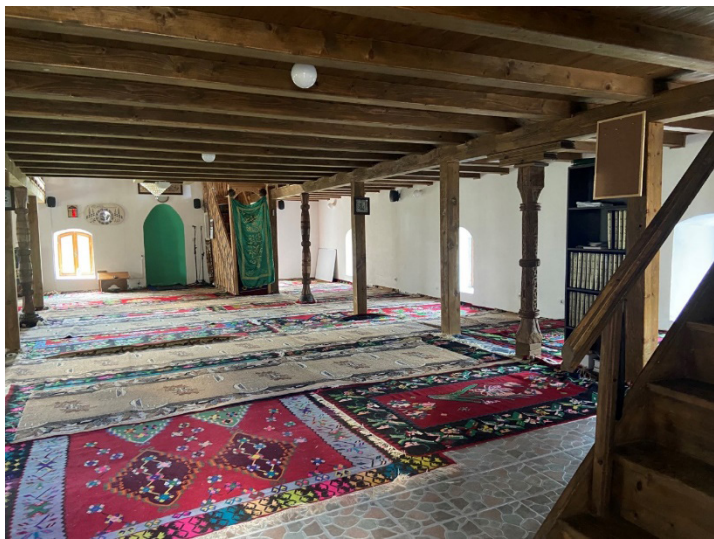
Detail of the interior of the mosque, taken in August 2022.

placed, which are covered with boards, which are covered with colorless varnish, which fits into the overall interior ambience of the mosque. The mahfils, of which there are two, rest on wooden pillars, some of which are carved with interesting ornamental details. The mahfils of the mosque, one above the other, are placed along the exit wall in the main area intended for performing prayers, opposite the mihrab. The mahvil occupies the mosque proctor with an opening in the middle of the front part of the mosque, so that there is an open visual and sound communication with the minbar and mihrab, as well as with the central front part of the mosque area. 4