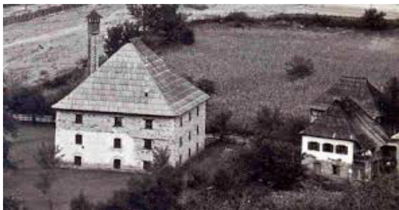
The old mosque in Petnjica - appearance in the first half of the 20th century.

The first religious buildings, schools and mosques in the territory of today's Montenegro, were created during the Ottoman administration. Like all other religious institutions, the work and operation of mosques was under the direction of the sultan, as the supreme imperial and spiritual head-caliph. He transferred his authority to lower levels through shaykhs, muftis and other religious officials. At the Congress of Berlin, Montenegro established its rule on a significant part of the former Ottoman Empire, and in 1912, after the First Balkan War, on other territories that are now part of Montenegro. Article 30 of the Congress of Berlin from 1878, as well as a special agreement between the Ottoman Empire and Montenegro, gave Muslims the right to form their own religious community-institution and independently manage religious affairs and property. Immediately after that, the first mufti of the Muslims of Montenegro was elected, who was appointed by King Nikola in 1878 with the consent of the Shaykhulislam from Istanbul. In addition to the mufti, three kadiluks were established with headquarters in Ulcinj, Bar and Podgorica.