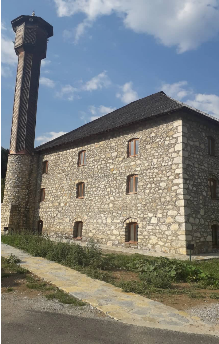
View of the mosque from the west side after the renovation in 2005.