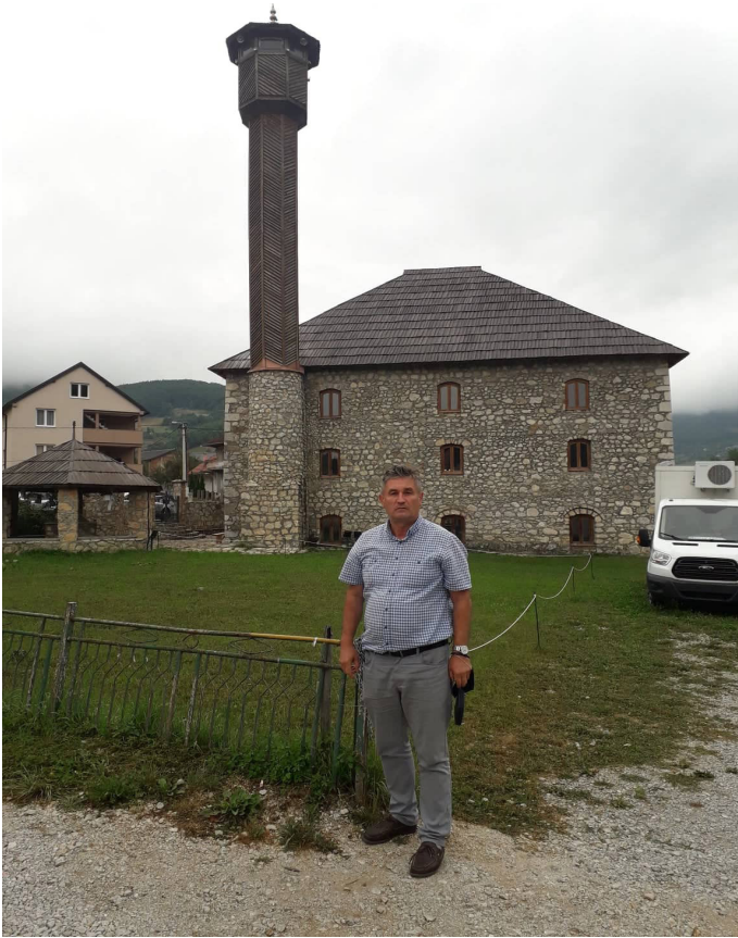
Today, the Petnjica mosque is attractive to many visitors

What is known is that the Petnjica mosque was renovated on several occasions. A significant renovation took place in 1903, which is confirmed by the preserved history of that, when the mosque was significantly expanded, and it remained in today's spatial dimensions. The mosque was also renovated during the socialist period. But despite that, towards the end of the 20th century. the mosque was in a very bad state, with cracked walls that threatened to collapse. The roof of the mosque was also in bad shape, leaking.