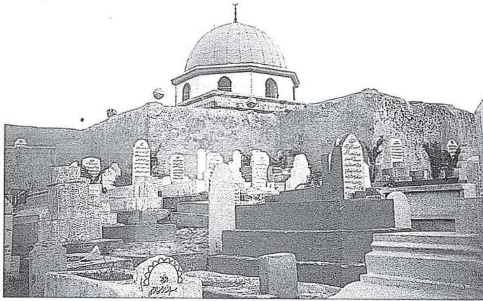
The shrine of Mawlānā Khālid al-Kurdī al-Shahrazūrī in Damascus.