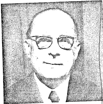
Daniel Mayer, French socialist politician.

MAYER, DANIEL (1909- ), French socialist politician. Born in Paris, Mayer was a journalist by profession, and wrote for the socialist newspaper Le Populaire . After the fall of France during World War II, he reorganized the Socialist Party, clandestinely editing the Populaire , and after the Liberation became its general secretary. Mayer was a member of the Chamber of Deputies from 1946 to 1958 and from 1946 to 1949 held a number of ministerial offices—labor, public health, and veteran's affairs. He was also president of the parliamentary committee on foreign affairs. He left parliament in 1958 to devote himself to the League for Human Rights of which he was president. Mayer was an active figure in Jewish affairs as president of *ORT. After the *Six-Day War, when French policy toward Israel took a hostile turn, Mayer emerged as a vigorous defender of the