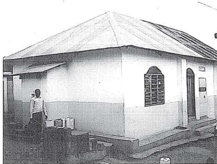
Kasubi Mosque-After renovation. The foundation and Mihrab are the only ancient ones (Picture taken on Friday 7 th February 2014)

In the colonial times, The Kabakaship of Mutesa I donated vast land to Muslims for mosque construction and Islamic centres, and "Kasubi Mosque" in the Kabaka palace is regarded to be one of the ancient Charities known in Uganda, its history is traced back to Kabaka Mutesa. 3